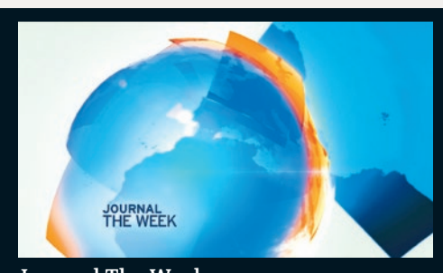
Journal The Week

People and Politics supplies the stories behind the news: Reports, analysis and background on major political developments. A political magazine presenting topics that Germany is talking about.