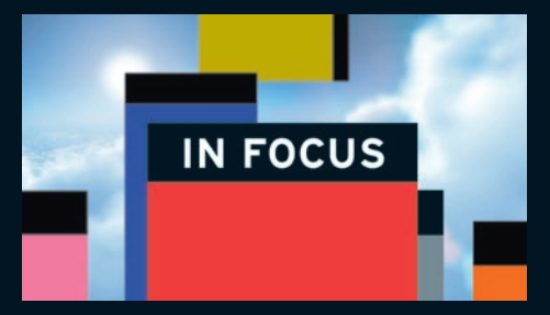
Kick off! In Focus